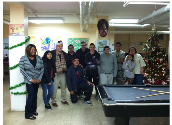
Above: The staff, kids, and Optimists, all benefit from our monthly support of the Culmore Teen Center.